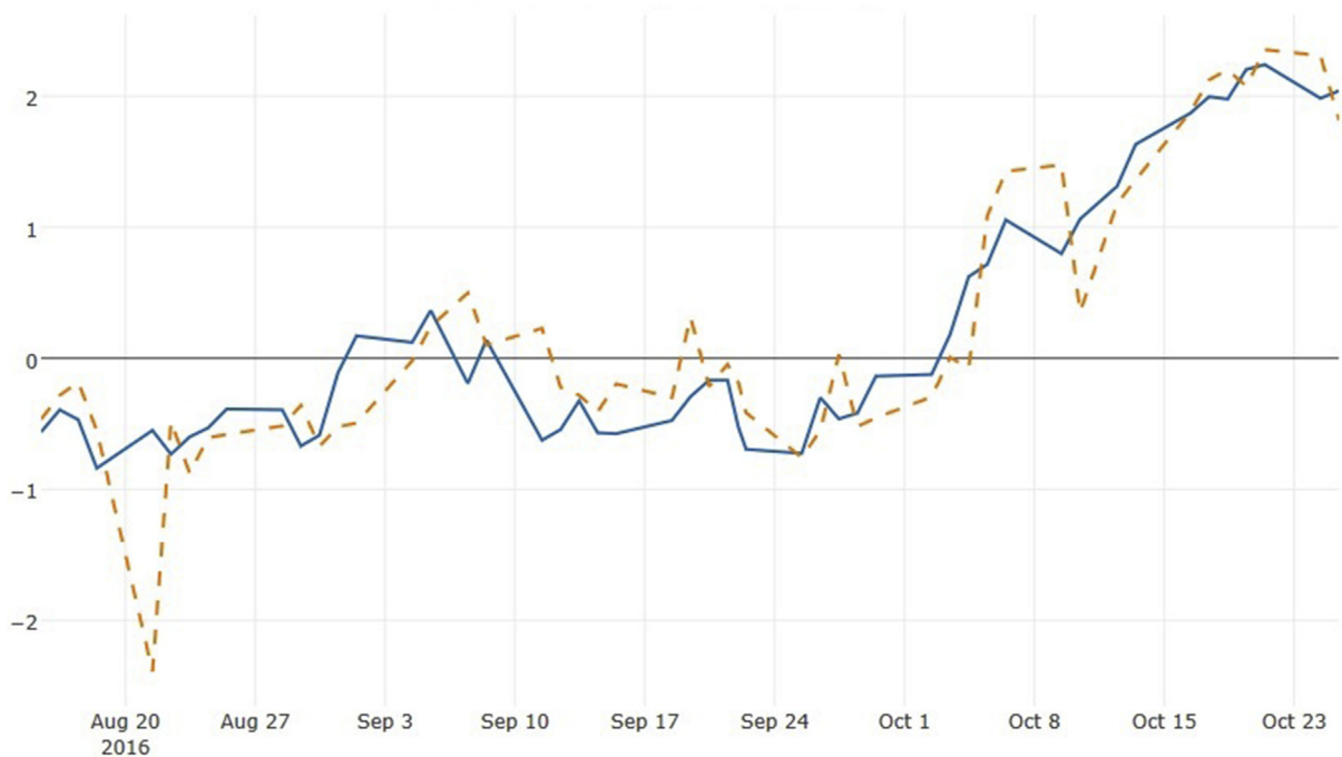
Fig. 1. Real returns and those predicted by the SVR model for daily prices. The continuous curve represents returns observed in the market, and the dashed curve represents returns predicted by the model.

To illustrate the general idea of price prediction, Fig. 1 visually demonstrates the difference between returns prices observed in the market and those predicted by the SVR model. The data used in this illustration are daily and are not used in the following experiments. As seen in Fig. 1, the SVR model implies considerable prediction error, and the literature seeks to minimise these errors, as in this study.